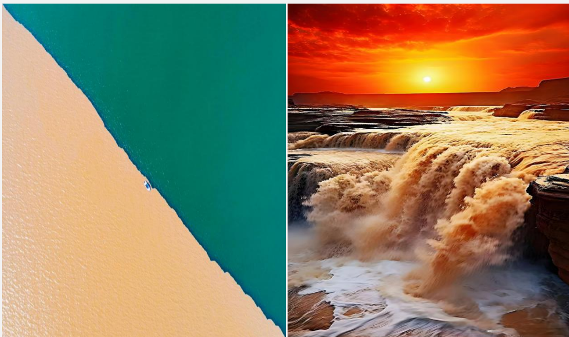
(The Yellow River.)

The Yellow River basin was the birthplace of ancient Chinese civilization. According to traditional Chinese historiography, the Xia Dynasty originated on the Yellow River banks around 2100 BC. The river has provided fertile soil for agriculture, nourishing the land of Shandong and giving birth to Qilu culture. The Shandong section of the Yellow River is 628 kilometers long, accounting for 11.5% of the total length of the river, entering Shandong province from Heze City, flowing through Jining, Tai'an, Liaocheng, Jinan, Dezhou, Binzhou, Zibo, and Dongying, and infusing into the Bohai Sea in Kenli District of