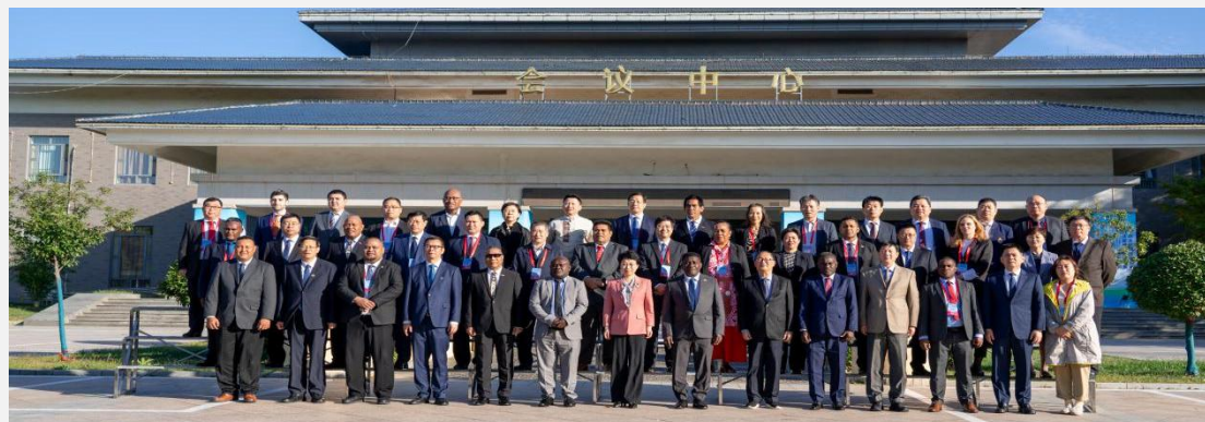
Academic Conference in Liaocheng on the Mutual Development of China-Pacific Island Countries