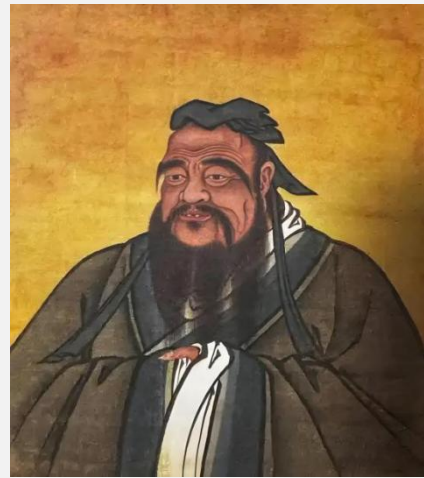
(Confucius. Courtesy of Wu Daozi)

Confucius (Chinese: Kong-zi), born in the State of Lu (part of today's Shandong province) in the Spring and Autumn Period (770 B.C. - 476 B.C.), was one of the best known Chinese philosophers traditionally considered as the paragons of Chinese sages. It is today well acknowledged that much of the shared cultural heritage of the Sinosphere originates in the philosophy and teachings of Confucius.