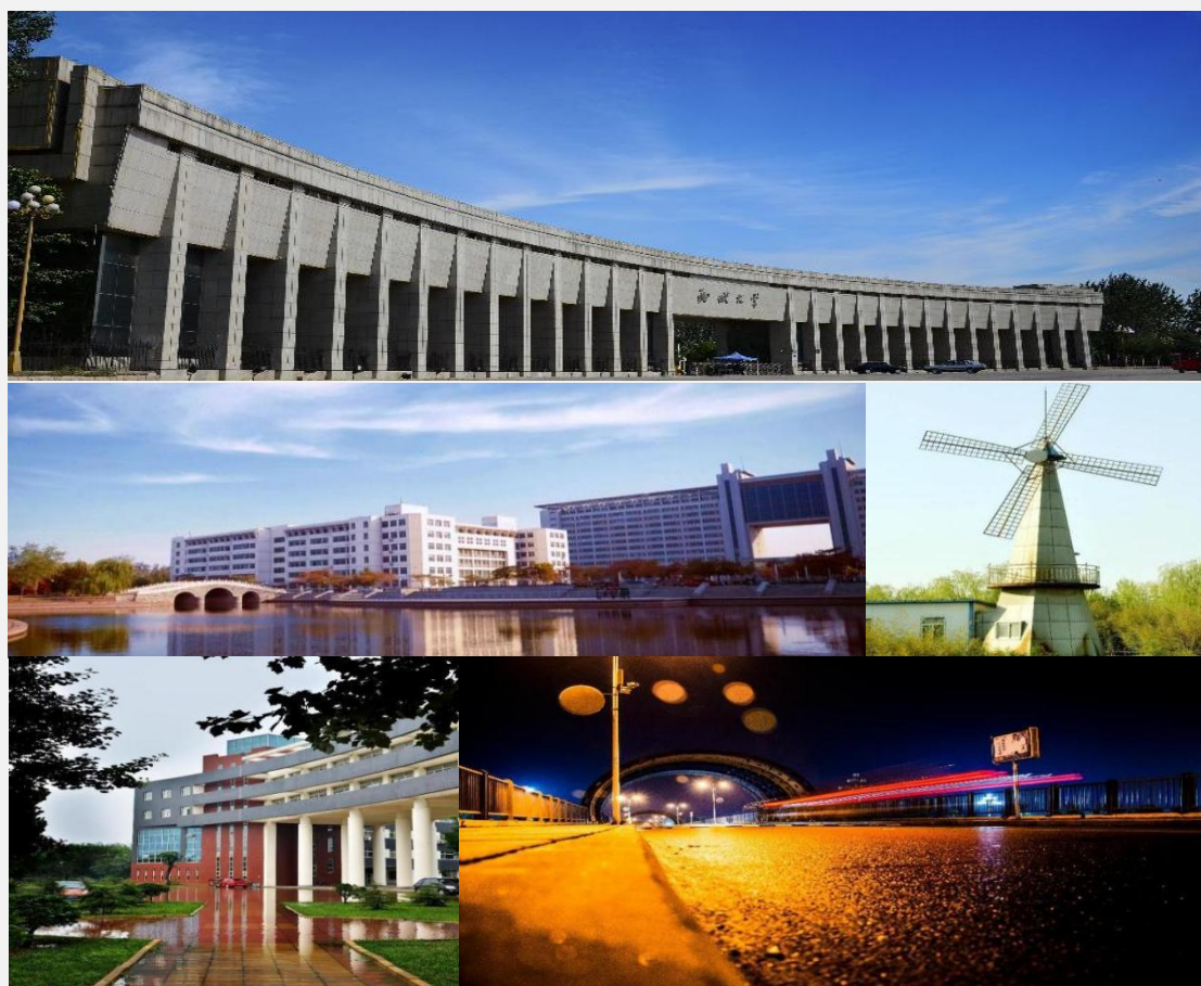
(LCU Campus.)

Liaocheng University, a public university located in the renowned Water City of Liaocheng in east China's most Confucian and prosperous Shandong province, has long been entitled to conferring to its students master and bachelor degrees on philosophy, economics, law, pedagogy, literature, history, sciences, engineering, agronomy, management, art, medicine, as well as on interdisciplinary studies. Presently within the university are 24 schools and 9 research institutes that cover 75 bachelor degree programs and 47 master