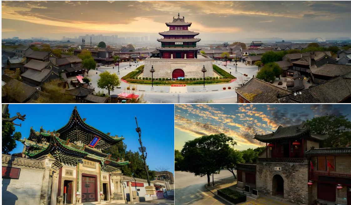
(Guangyue Tower, Shan-Shaan Guild Hall, and Turtle-Head Rock)

business civilization, and Yellow River Culture representing the agricultural civilization in China. The blending of different cultures and civilizations enriches the city with unique local and cultural features, abundant historic relics and tourist resources, and a fast-developing local economy.