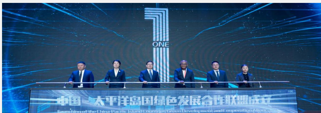
Launching of the China-Pacific Island Countries Green Development and Cooperation Alliance at Liaocheng