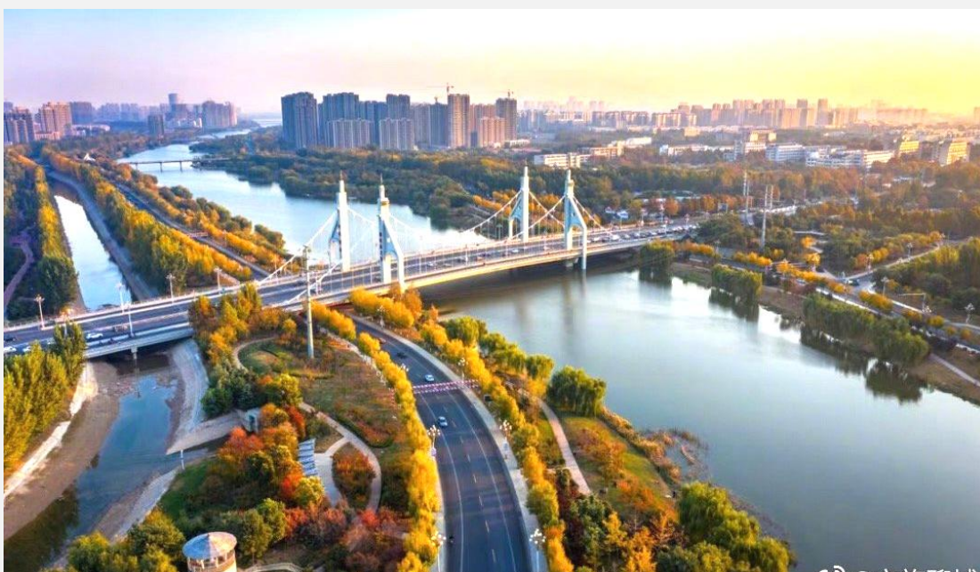
(View of Liaocheng by LCU)

Liaocheng Municipality, where Liaocheng University is located, covers an area of 8,715 square kilometers with a population of over 6 million. Meeting at the city are Beijing-Kowloon Railway from north to south and Qingdao-Jinan-Handan Railway from east to west, coupled with national expressway network, national bullet train network and the forthcoming local airport, hence an important transportation hub in northern China.