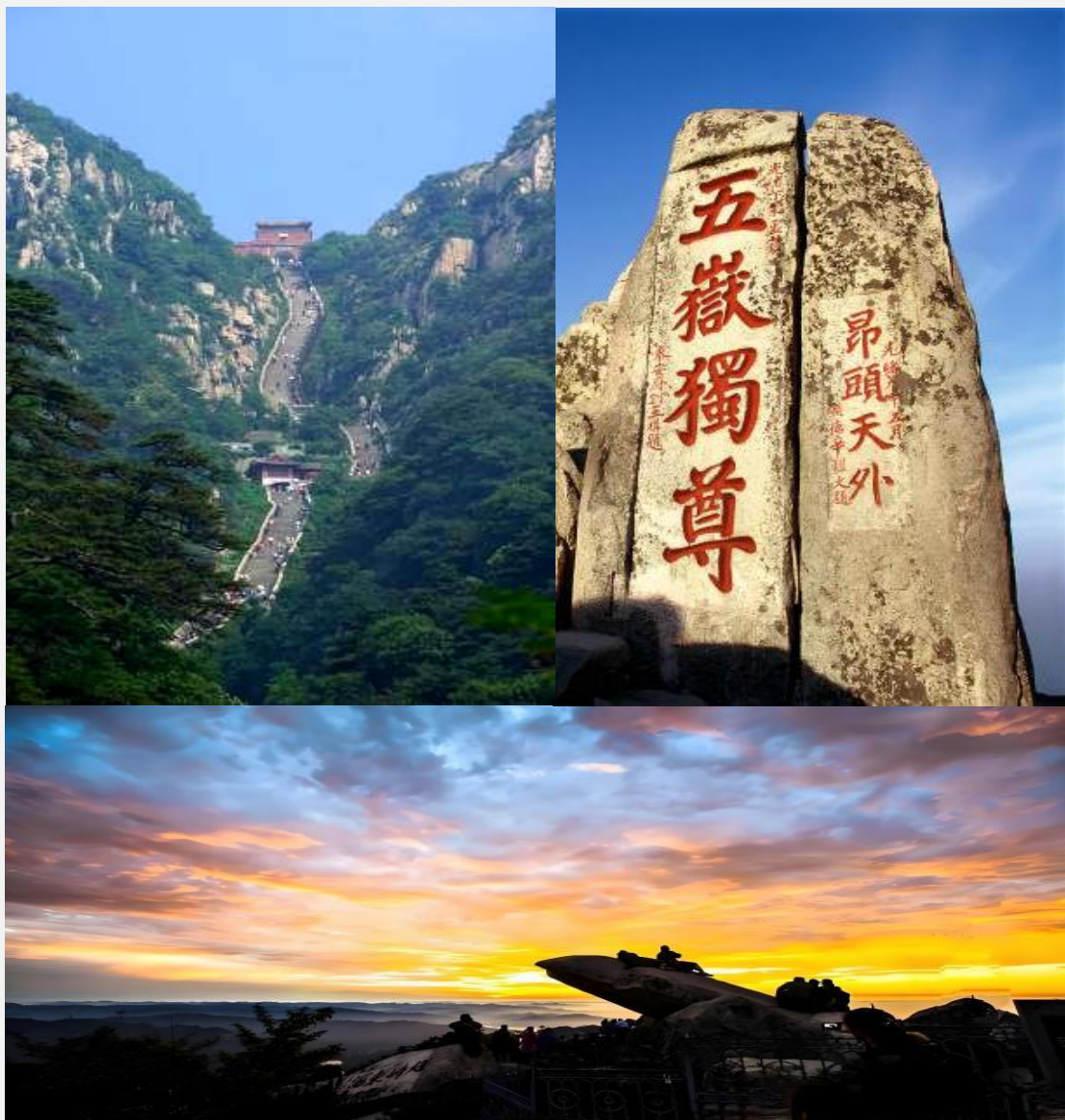
(Picturesque Views on Mt. Tai)

Mt. Tai (Chinese: Tai-shan) is a mountain of historical and cultural