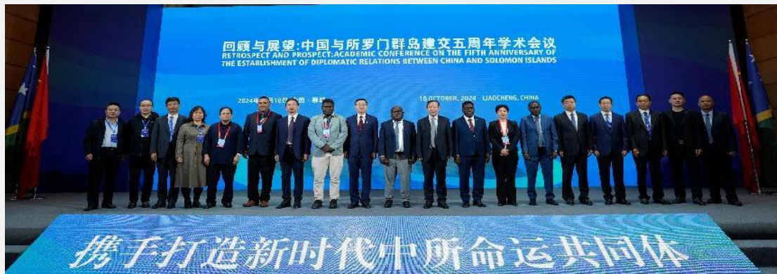
Academic Conference in Liaocheng on the 5th Anniversary of the Founding of Diplomatic Relations Between China and Solomon Islands