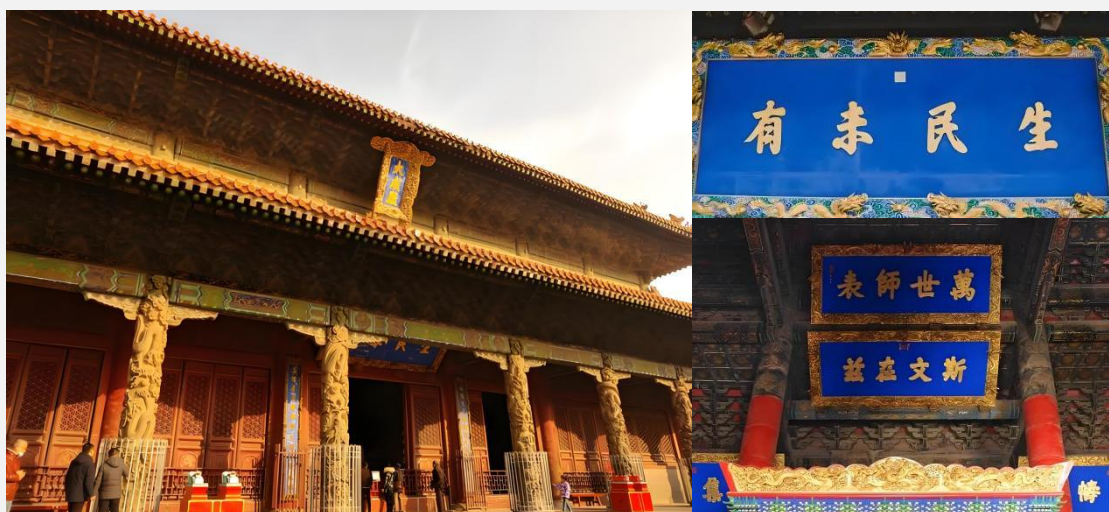
(Hall of Great Achievements in Qufu, Shandong Province)

His philosophical teachings, called Confucianism, emphasized personal and governmental morality, harmonious social relationships, righteousness,